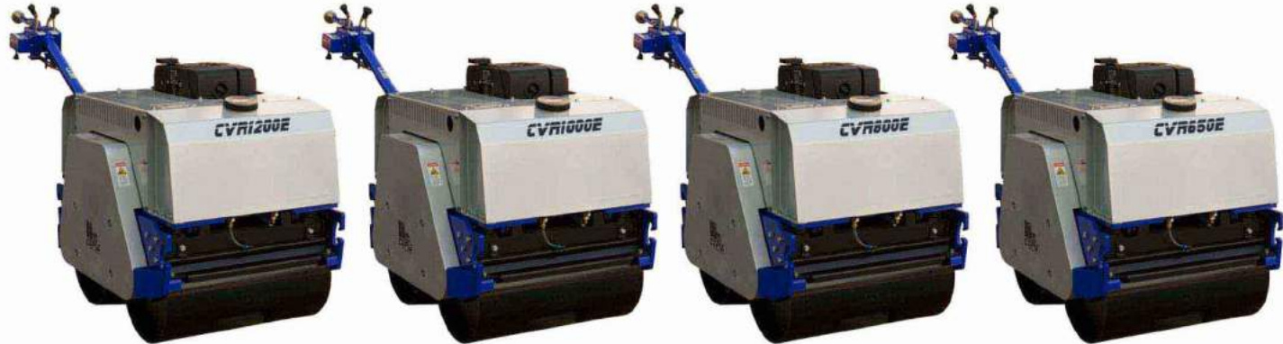
CVR1200E42 (OPTION : CVR1200X42) CVR1000E38 CVR800E32 CVR650E28

CVR1200X42 / CVR1200E42 / CVR1000E38 / CVR800E32 / CVR650E28