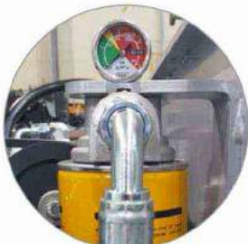
High density hydraulic oil filter