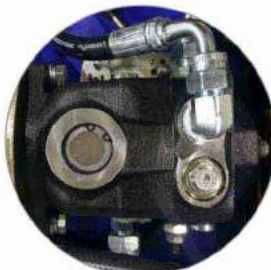
Hydraulic piston pump