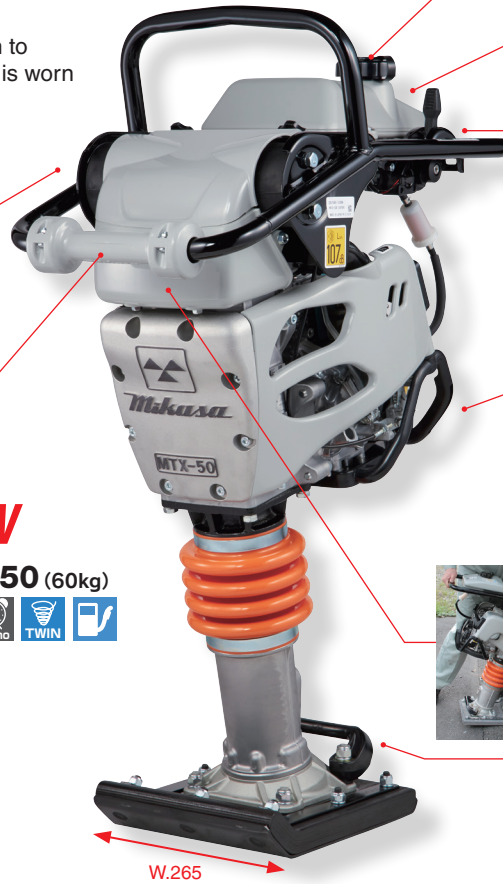
● EVAPO Certificate