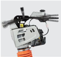
● VAS Handle