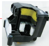
● Large Twin Cyclone