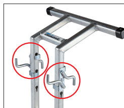
● Hook Easy to adjust