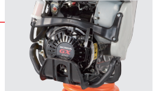
● Engine Guard