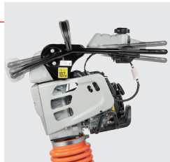
● VAS Handle