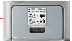
● Tacho Hour Meter