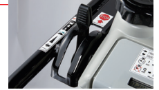
● Throttle Lever with fuel cut off mechanism inter locked kill switch